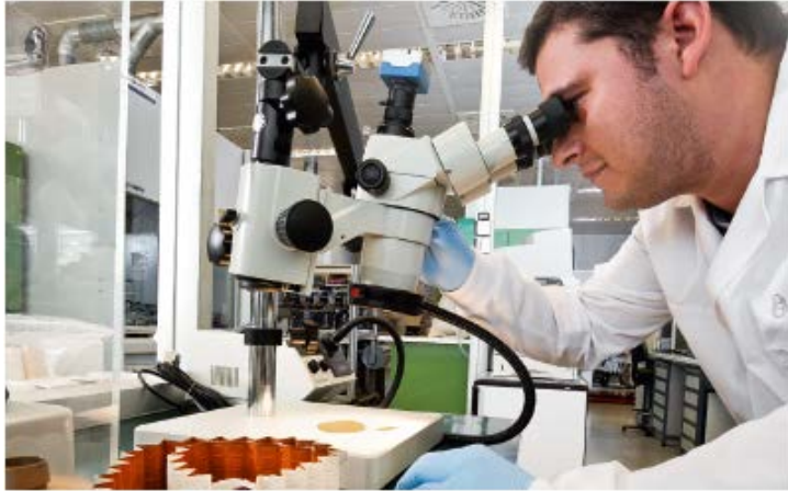
Fine dust test